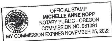
Notary Public-State of Oregon